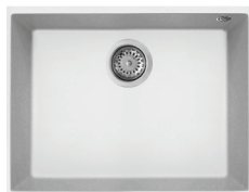
Pearl White (WH)