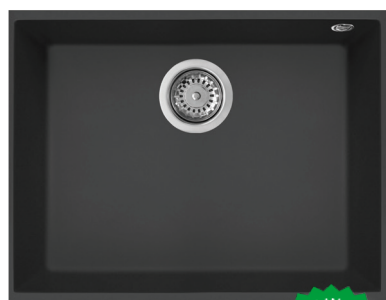
Pearl Black (PB)